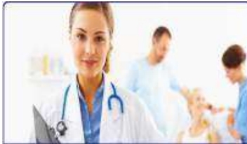
Mini Med Healthcare Insurance

Did you know it can cost over $4000 to send a loved one to Latin America for burial? The Group Accident & Repatriation policy pays up to $10,000 for the return of the body plus an additional $50,000 Accidental death benefit & more – for only $15 per month !