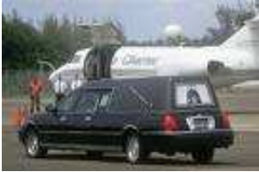
Group Accident & Repatriation of the Body Insurance