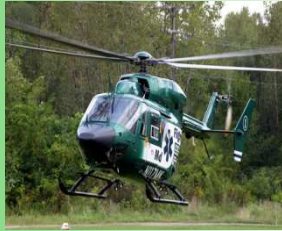
Medivac to Trauma Center