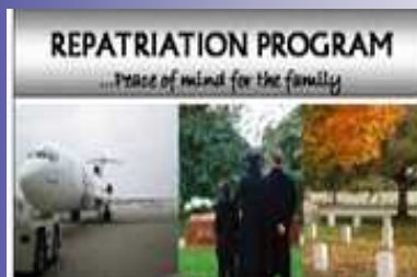
Repatration Policy (Insurance)

Association, Chamber of Commerce, Church Group, or Trade Organization