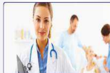
Mini-Med Medical Program (Insurance)