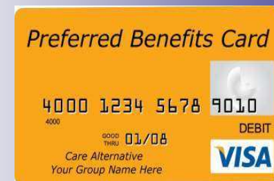
Pre-Paid Debit Card Program (FDIC Insured)

- In Conjunction with David Macgregor Company -