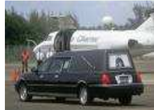
Repatriate to Homeland